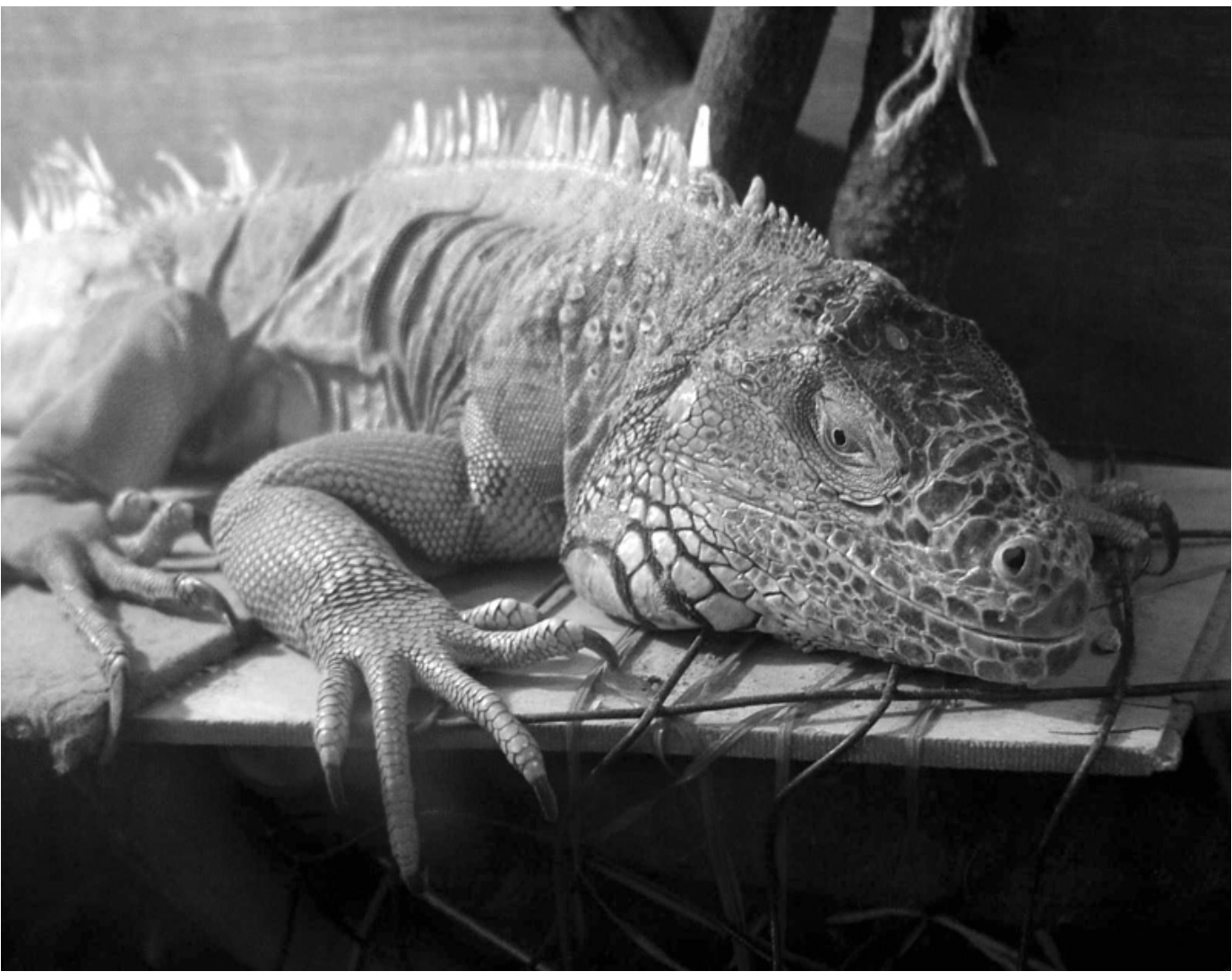
Offering something a little different for the weekend.... Amie the iguana.