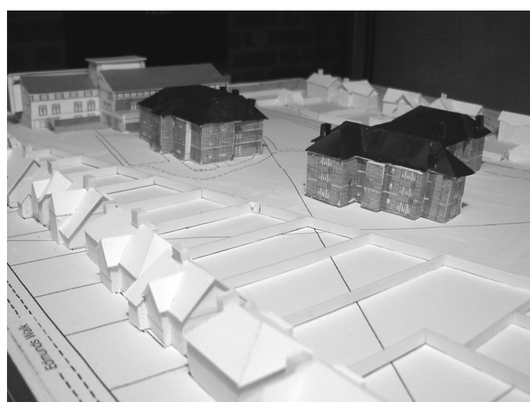
Scale model shows a NOGO area.