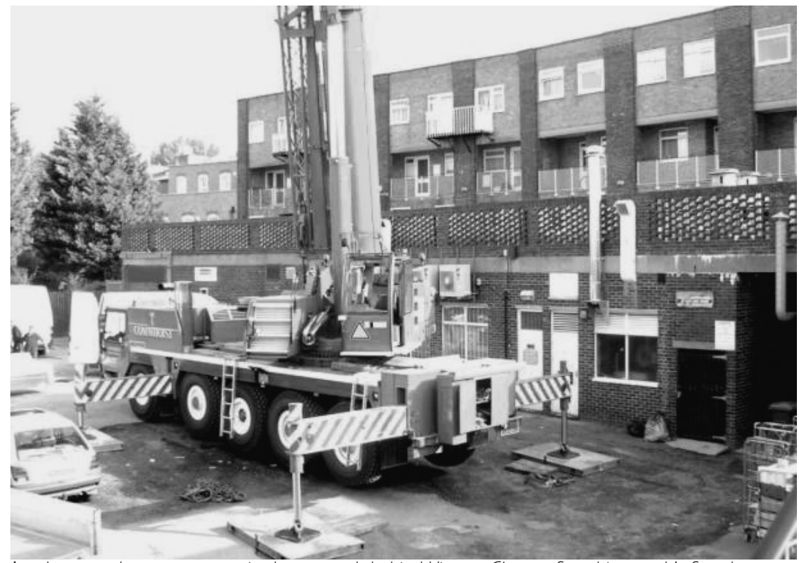
Another unwelcome presence in the car park behind Viceroy Close - See this month's Soapbox on page 11.