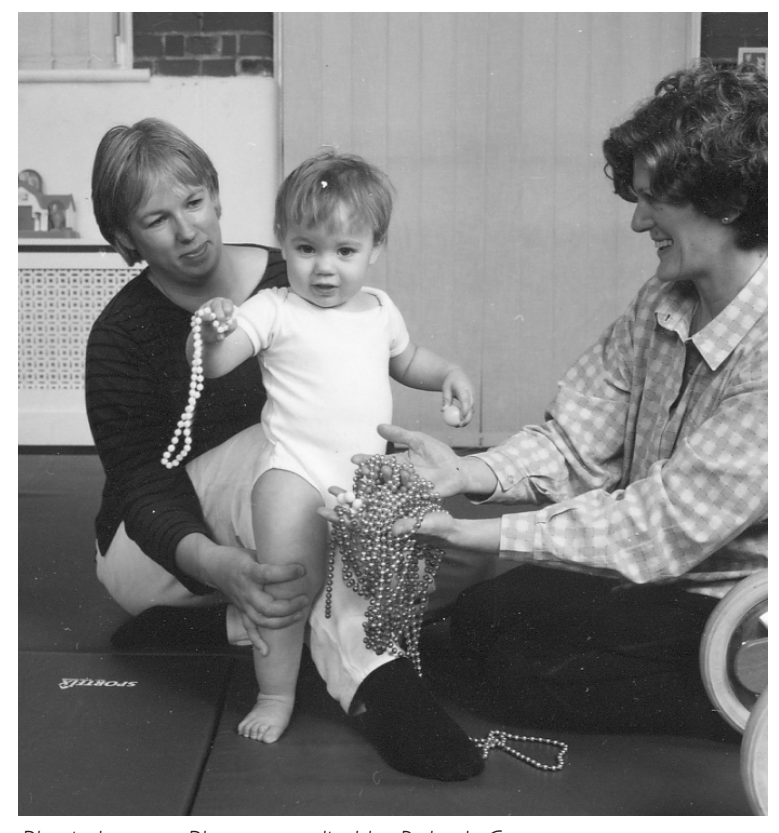
Physiotherapy

The Bobath Centre is a major training centre; high proportions of NHS therapists are Bobath trained. Bobath therapists work together as a team, combining their disciplines to improve the quality of posture and movement for each child. The whole family participates in ongoing activi-