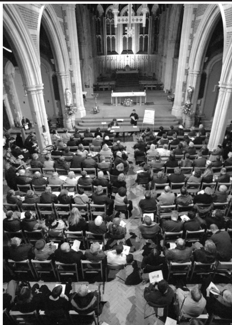
Full house - the WOW meeting at All Saints Church.

To contact Warning On Waitrose write to 22A, Aylmer Parade, London N2 0PH or see www.stopsuperstore.co.uk