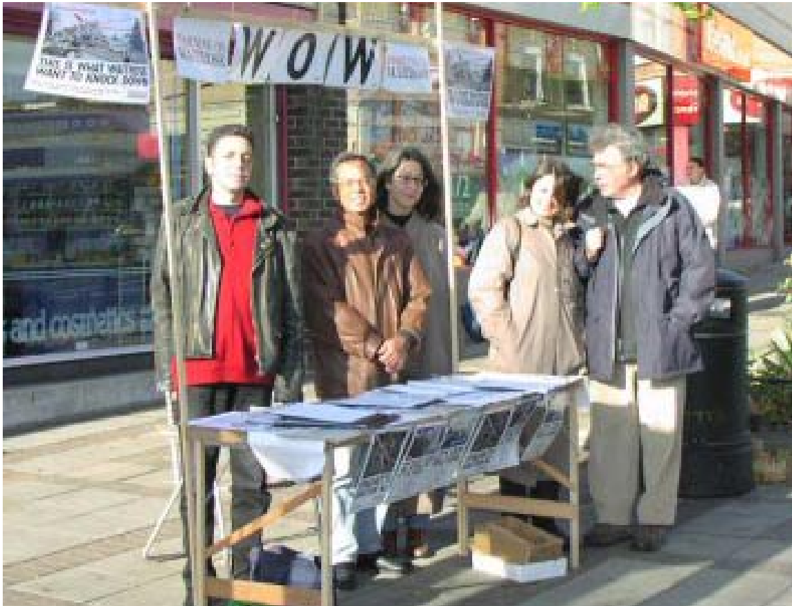
Local pressure group Warning on Waitrose canvasses public opinion at a stall by Viceroy Parade on 15 November.