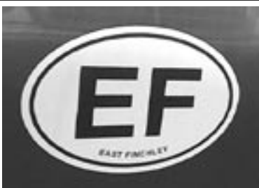
EF car sticker.

The letters are in black on an oval, white background (someone has suggested adding the archer symbol to it). It's certainly different and is the sort of thing you could slip inside a birthday or Christmas card.