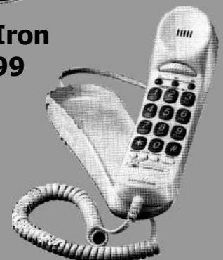
2 Piece Telephone white or silver only £10.50