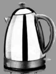
Kenwood Set only £38.99