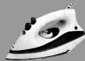
Micromark Iron only £12.99