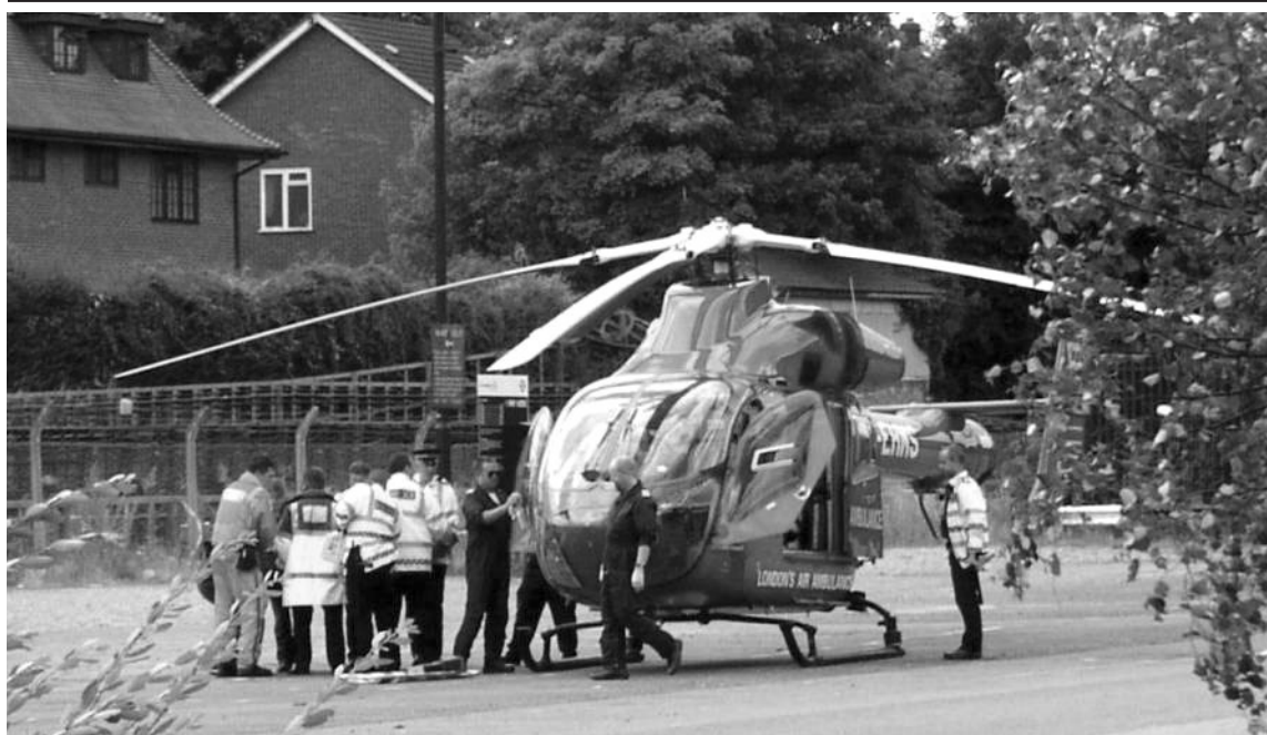
The injured woman was taken to hospital in the air ambulance.

A community newspaper for East Finchley run entirely by volunteers.