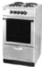
Electric Cooker (also available in gas) £165.00