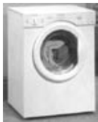
White Knight Compact Tumble Dryer £126.95