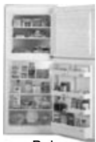
Beko Fridge/Freezer £193.50

Free Local Delivery Next Day Order from our New counter catalogue