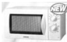
Samsung Compact Microwave £54.99