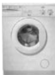
Whirlpool 1000 RPM Washing Machine £198.50