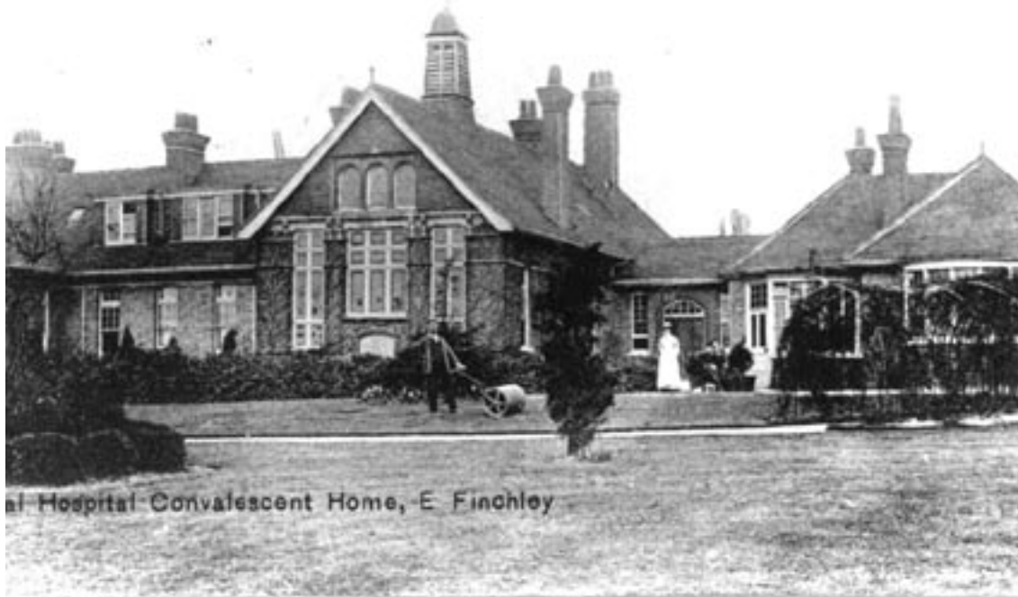
al Hospital Convalescent Home, E Finchley

Most people seemed to agree that the popular and successful Hampstead Institute does deserve its own premises. It has shared a building with Henrietta Barnett School for a long time and ideally it should remain within the borders of the Suburb (in this case, only just). For many it would be a welcome addition