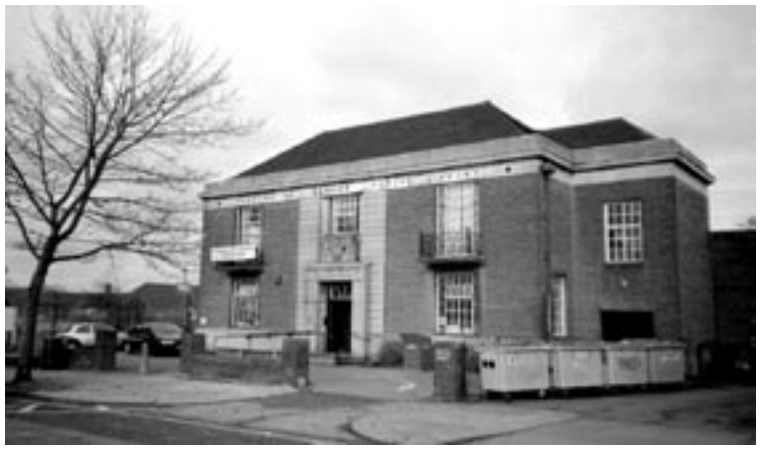
Real character - the existing library building in East Finchley High Road.