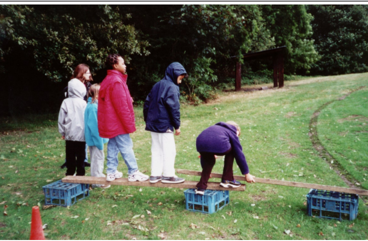
Holy Trinity children bridge building at moat mount