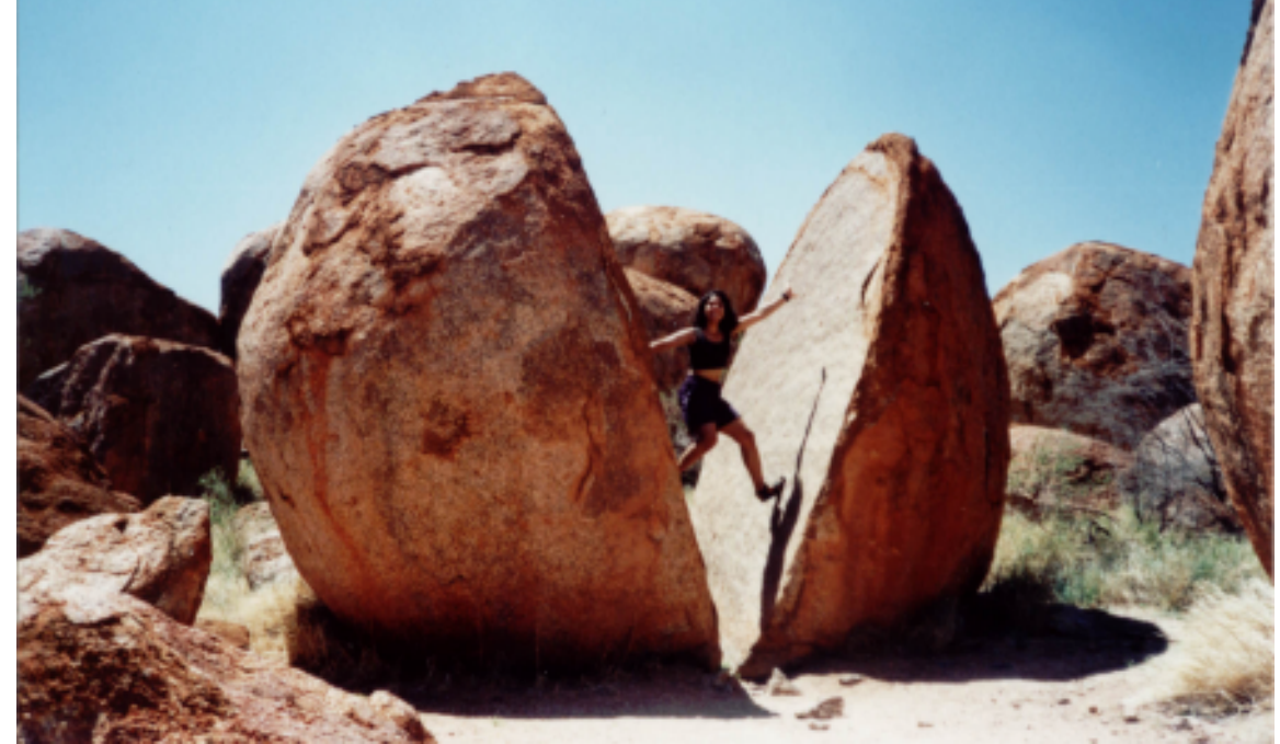
Erini between two slabs of the Devils Marbles, Northern Territory, Australia.

89 High Road, East Finchley, London N2 8AG. Tel: 020 8444 9098.