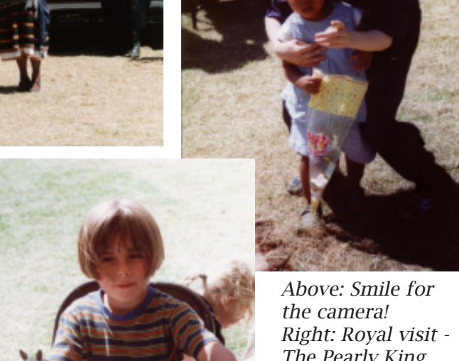
Above: Smile for the camera! Right: Royal visit -The Pearly King and Queen of Peckham