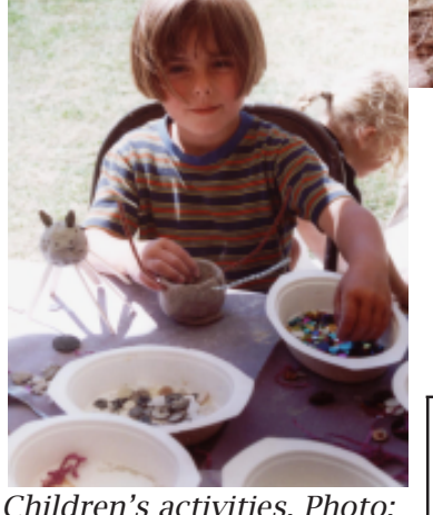
Children's activities.