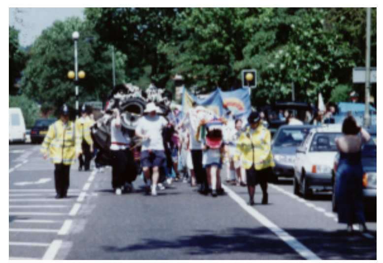
Above: The start of the parade outside Martin Schools.