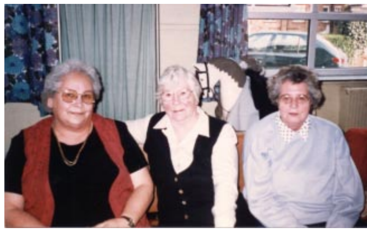
Some members of Oak Lane Friendship Group.

Opening on the 14 January is Wonderland by Michael Winterbottom, director of the under valued Welcome to Sarajevo. Wonderland is a gritty social drama set on a south London estate.