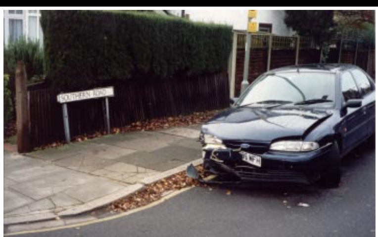
The aftermarth of an accident close to Baronsmere Road. (See letters, left.)

2. The effect on other sectors of East Finchley has been thoroughly investigated by the local