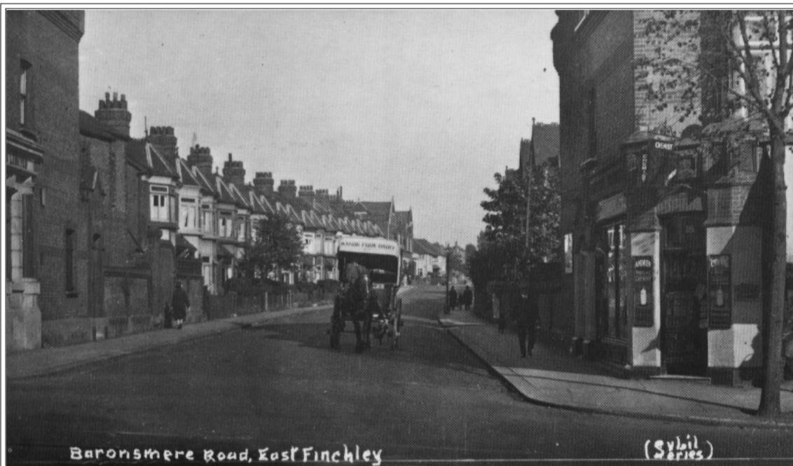
Baronsmere Road, East Finchley (Sybil Series) BARONSMERE ROAD, E. FINCHLEY 1935 10E